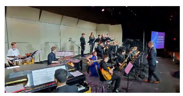
Jazz Ensemble in concert

If your school has yet to get involved in the ATSSB Jazz process, I highly encourage you to order the music and play it with your students. The music fits our small school programs very well, allowing single director schools an easy way to teach the music. Whether you have one interested student or twenty-one students, find out when your region's jazz auditions are being held and get the students entered.