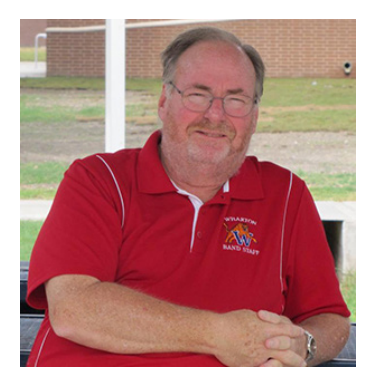
in memory of Bruce Kenner

If you have a senior in your band interested, have them complete the application at: http://www.123contactform.com/form-1081548/Scholarship-Application-Form